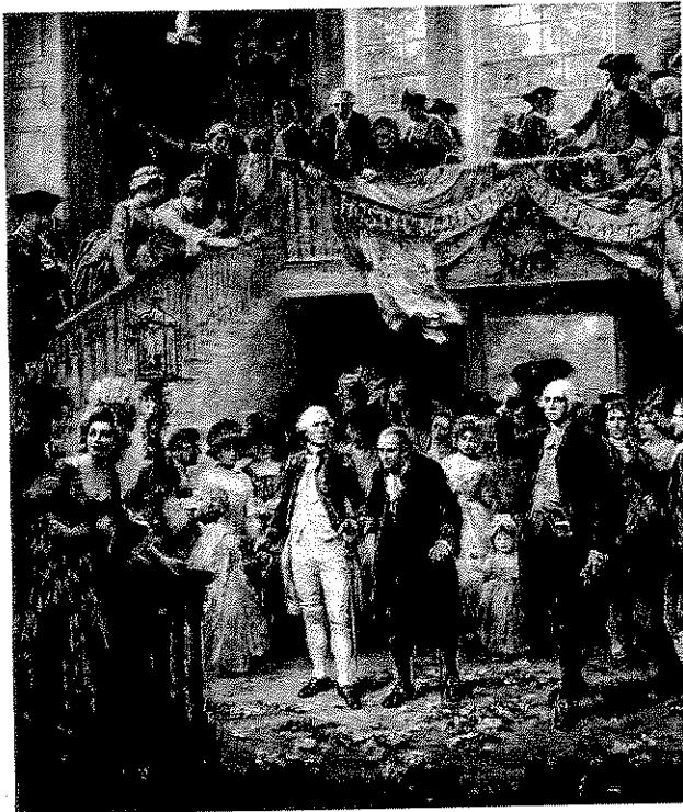
>> Ben Franklin (with cane, center) and George Washington (raising hat, right) were among the delegates to the Constitutional Convention in 1787.

Soon after the meeting began, the delegates realized they would have to do more than simply revise the Articles of Confederation. They chose instead to write an entirely new constitution for the nation. They disagreed.